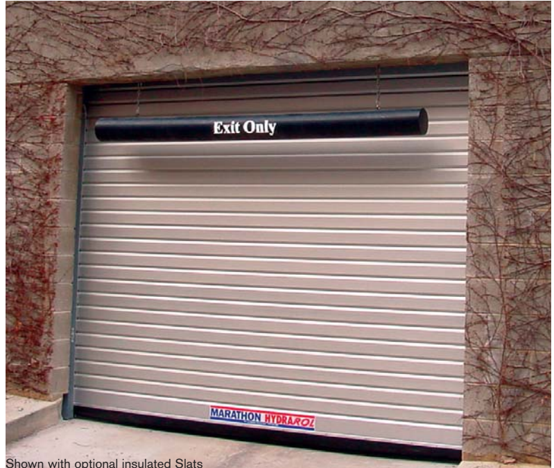
Shown with optional insulated Slats

Innovative Design. Superior Performance. Exceptional Value.