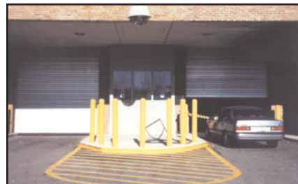
PROGRAMMABLE LOGIC CONTROL SYSTEM Allows interface with building security systems.