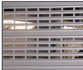
OPTIONAL POLYCARBONATE WINDOW SLATS Allow visibility without compromising security.