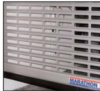
FENESTRATED ANODIZED ALUMINUM SLATS Provide security while maintaining air flow.