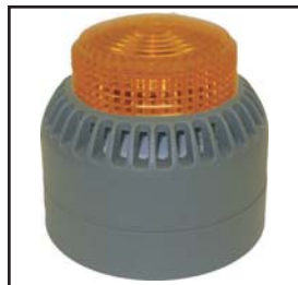
OPTIONAL PRE-ANNOUNCE TO CLOSE KIT Available with light, alarm or combo.