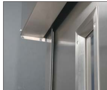
COMPLETE STAINLESS PACKAGE Provides the ultimate in sealing and cleanability.